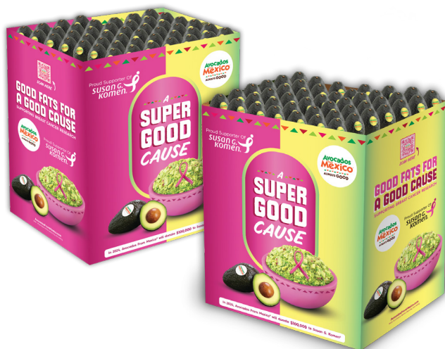
SGK MEDIUM BIN 25"L x 17"W x 30"H