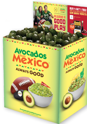
MEDIUM BIN Generic Base & Thematic Header 25"L x 17"W x 40"H