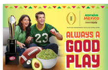
DOUBLE-SIDED THEMATIC DISPLAY SIGN 11"W x 7"H