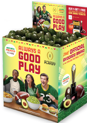
MEDIUM BIN Thematic Base & Header 25"L x 17"W x 40"H