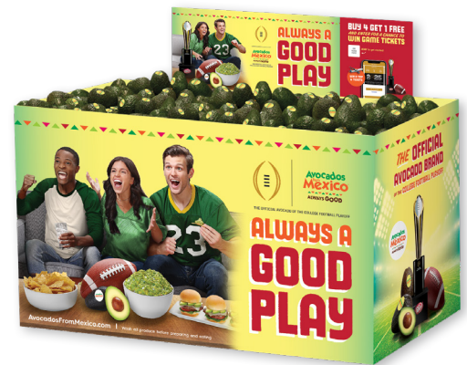
MULTI-SECTIONAL BIN Thematic Base & Header 51.5"L x 24.8125"W x 48"H