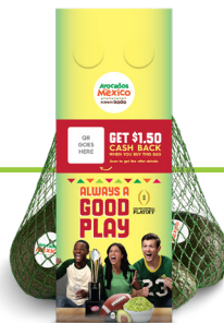
THEMATIC PACKAGING WITH REBATE To order thematic bag graphics please contact your supplier. ORDERS DUE 8/13/24