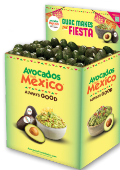
GENERIC MEDIUM BIN with Thematic Header 25"L x 17"W x 40"H