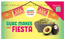
Front & Back