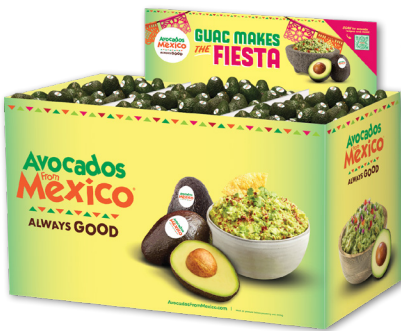
GENERIC MULTI-SECTIONAL BIN with Thematic Header 51.5"L x 24.8125"W x 48"H