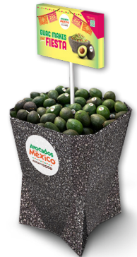
CINCO MOLCAJETE BIN with Thematic Header 24"L x 24"W x 42"H