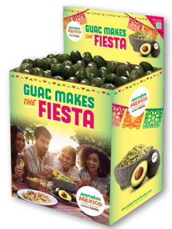
CINCO MEDIUM BIN with Thematic Header 25"L x 17"W x 40"H