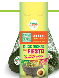
CINCO THEMATIC PACKAGING To order thematic bag graphics please contact your supplier.