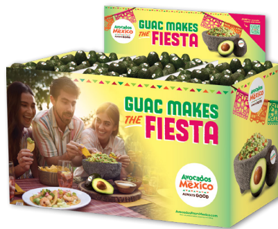
CINCO MULTI-SECTIONAL BIN with Thematic Header 51.5"L x 24.8125"W x 48"H